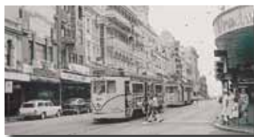
Queen Street, Brisbane circa 1960