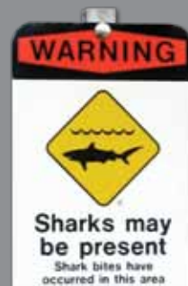
Warning on the Island of Maui in Hawaii

Authorities at other popular tourist destinations for example, Hawaii, erect shark warnings. Queensland councils already erect warning signs for crocodiles and stingers.