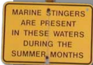
North QLD beach warning

All victims survived but they follow 2008 shark fatalities in Western Australia (December) and Ballina (April).